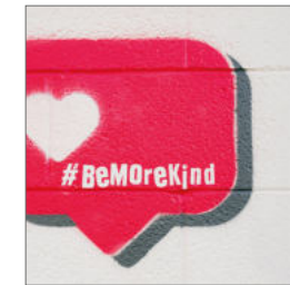
Social media images